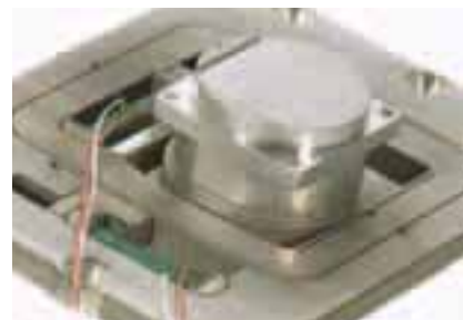
Piezo Multi-Shot Element

As the successor model to the traditional Sinarback in the field of multi-shots, the Sinar eVolution86 H is the absolute high-end solution for all the tasks in the studio. With this new digital back, the concept of display-less Sinarbacks is extended logically in order to gain greater image quality and faster pace by means of a higher transfer rate to the computer. Thanks to its high-performance cooling, its favorable operating performance in daily work and the value merit of the investment is maximized.