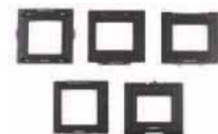
Adapters for different camera platforms