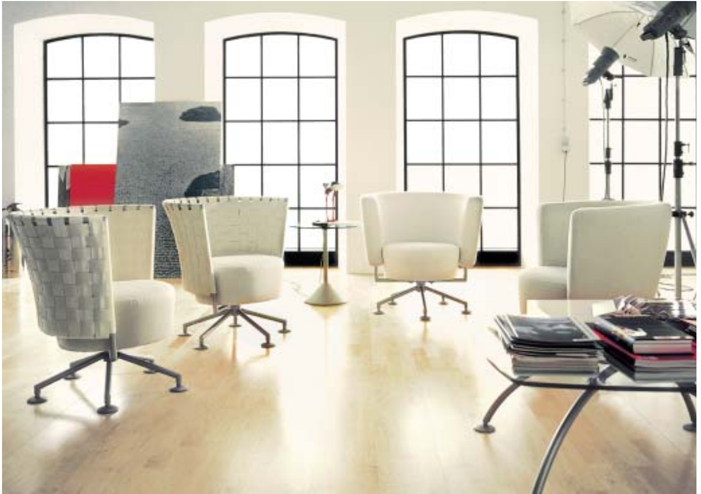
COR Sitzmöbel, Rhetta-Wiedenbrück/Germany